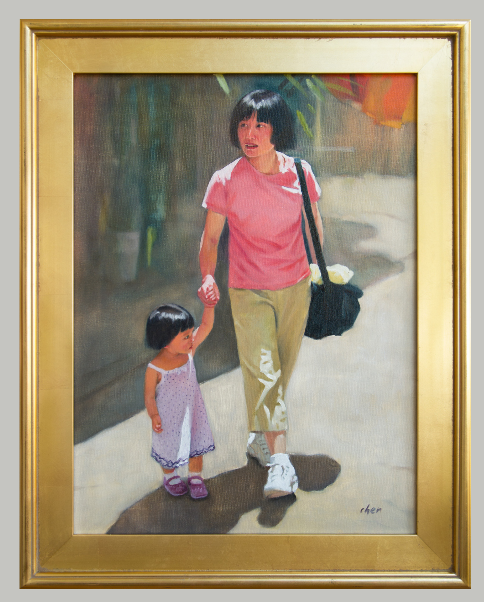
Mom and Daughter 18x24 inches Oil on Canvas