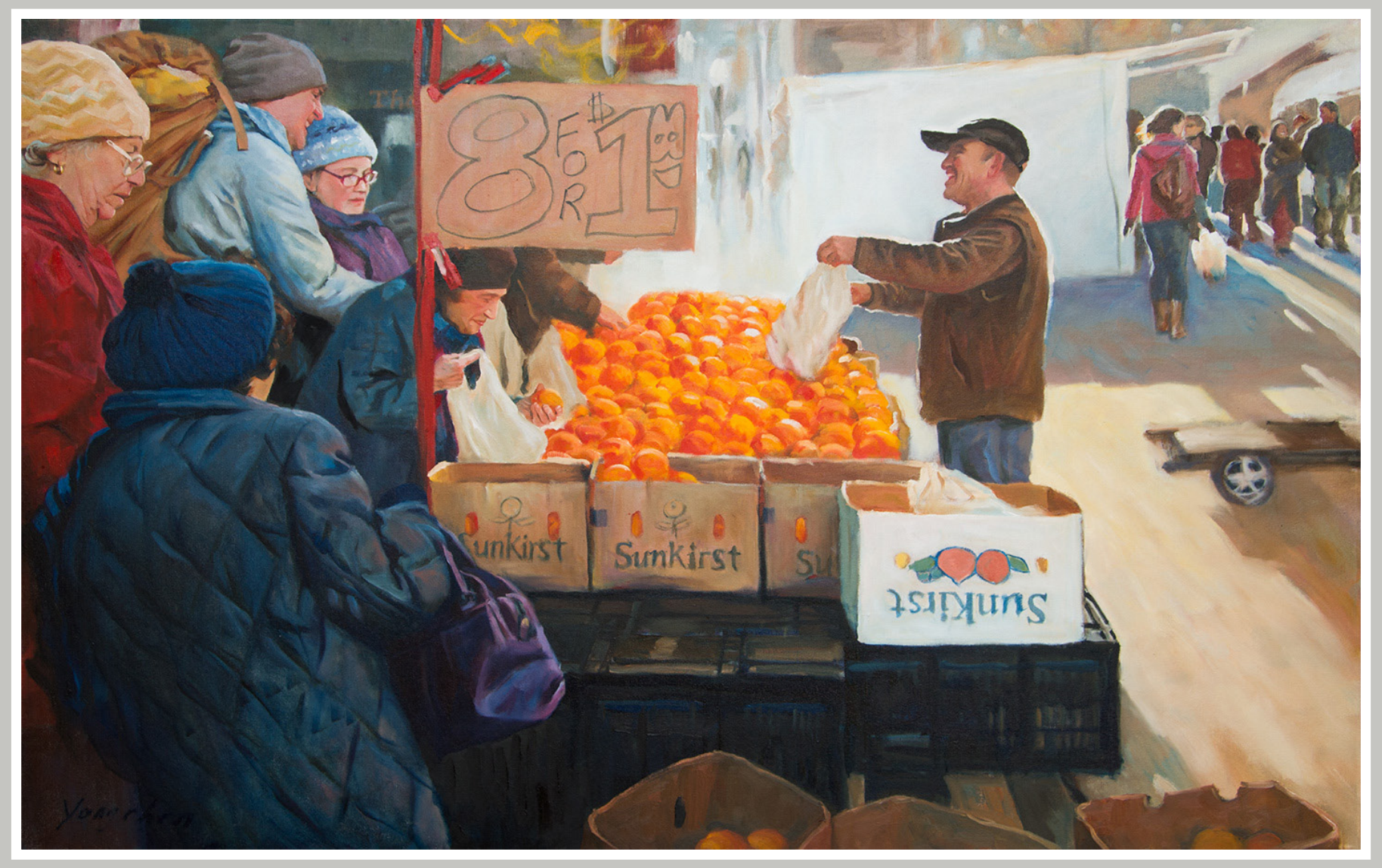
Farmers' Market 48x30 inches Oil on Canvas