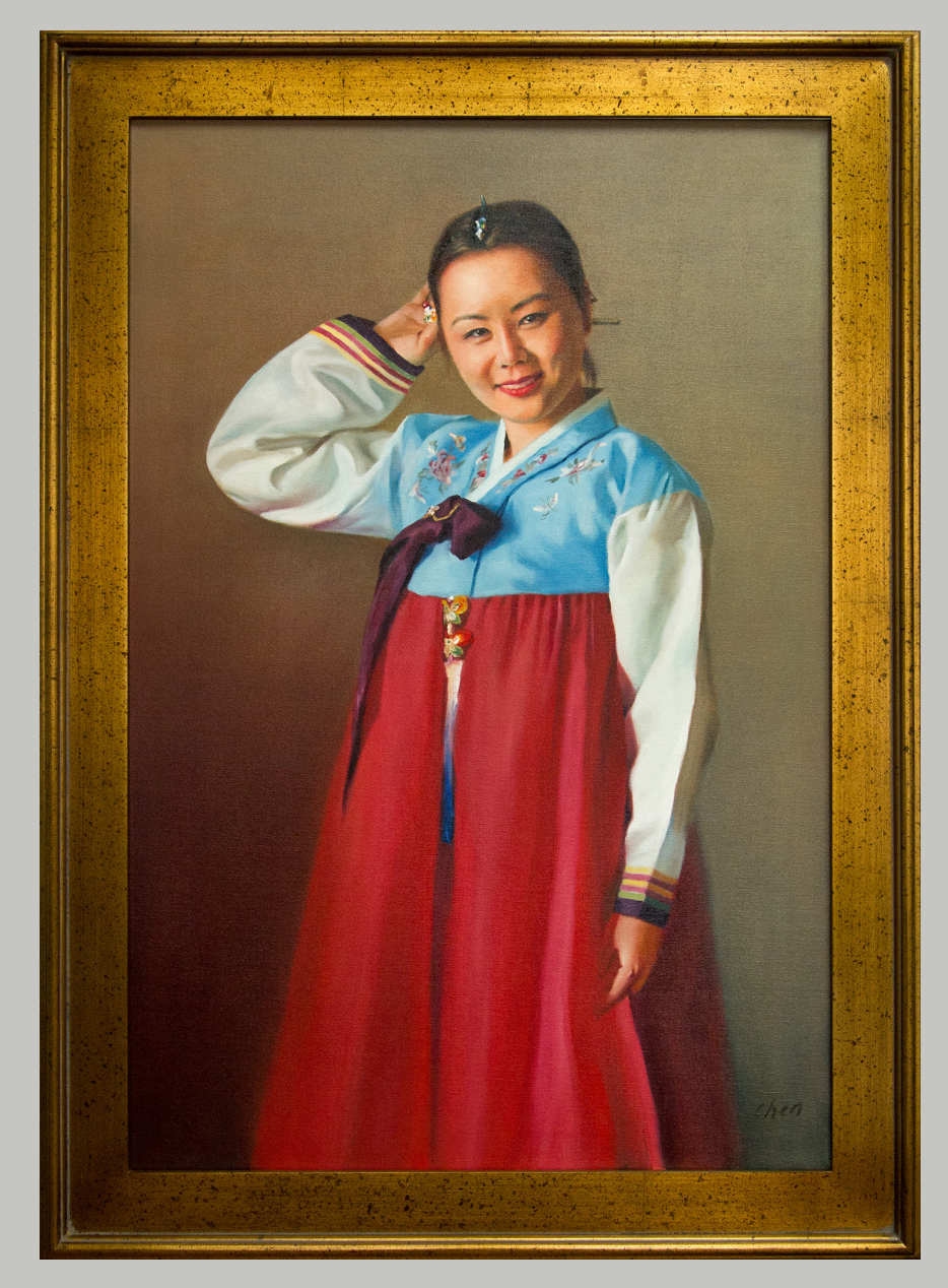
Eva - art student 24x36 inches Oil on Canvas