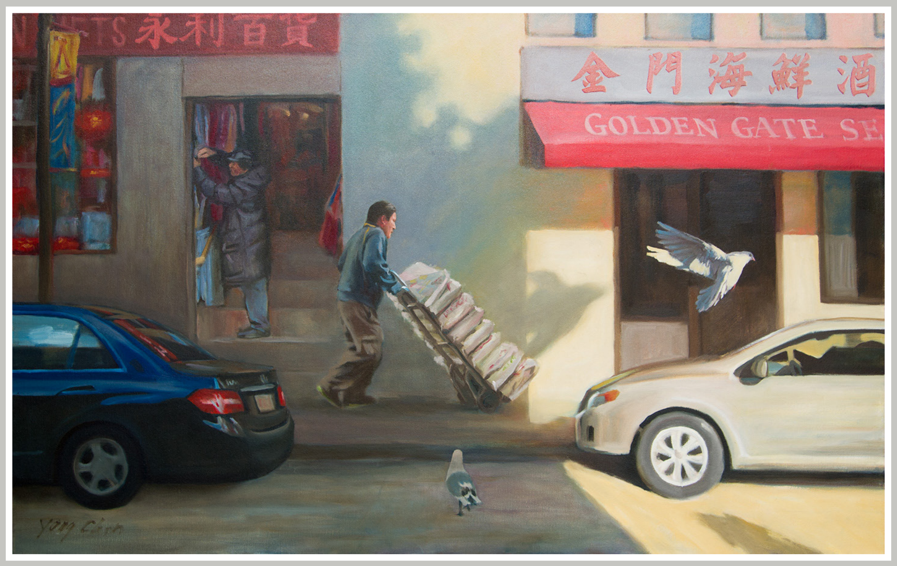
Morning Delivery 48x30 inches Oil on Canvas