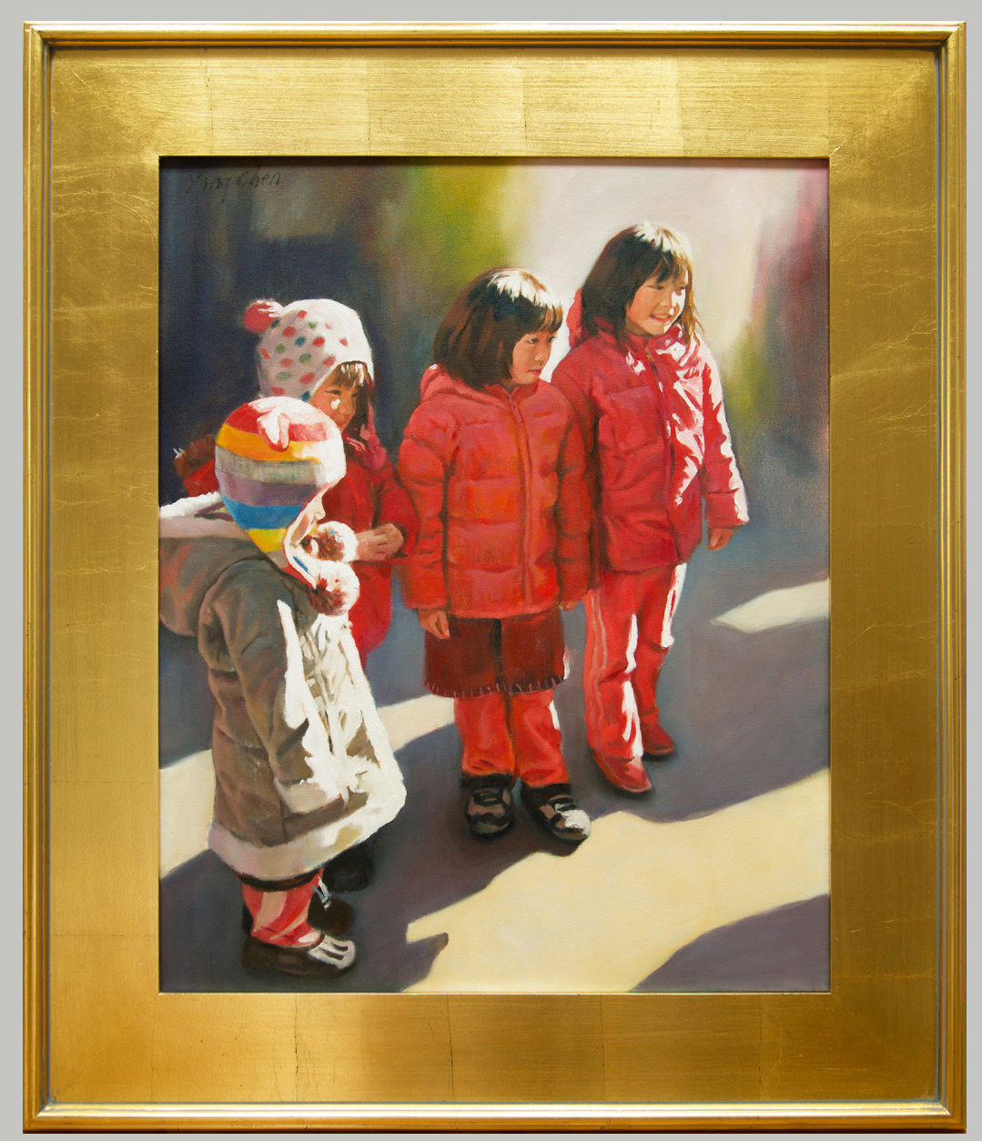
Chinese New Year Reunion 24x30 inches Oil on Canvas