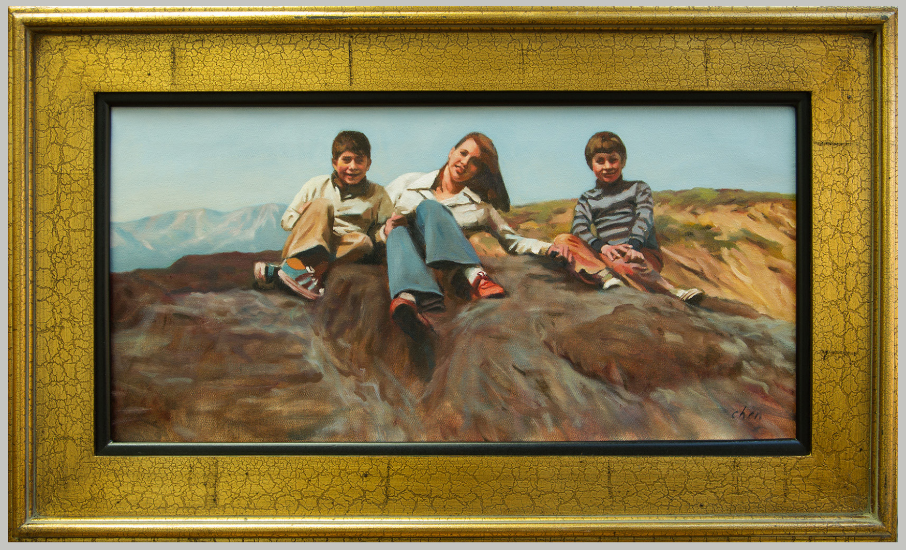
The Moors - a visit to England 24x12 inches Oil on Canvas