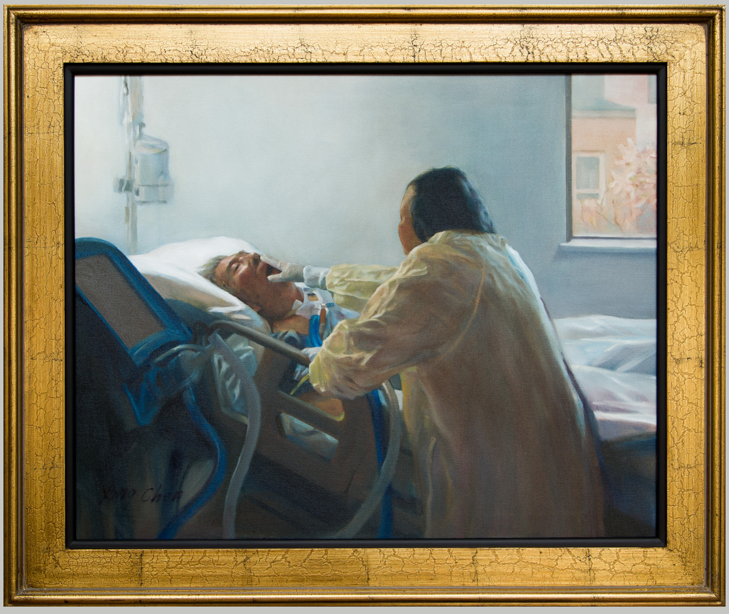
The Last Touch – my parents 30x24 inches Oil on Canvas

Bannister Gallery | December 6 - December 28, 2012