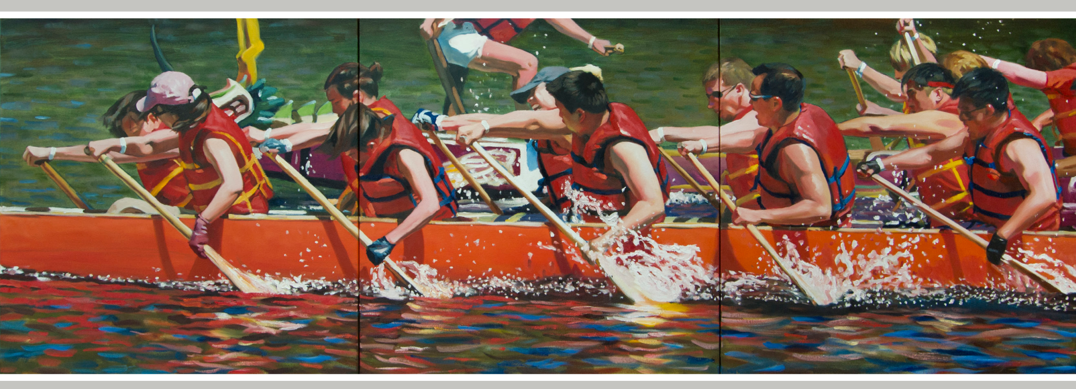
Rowing Together – dragon boat festival 90x30 inches Oil on Canvas